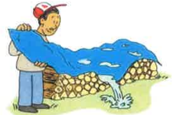
Empty water that collects in folds of tarps.