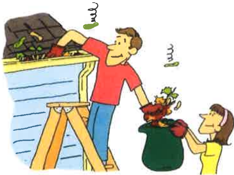
Clean leaves and debris from roof gutters, downspouts, and elephant trunk extensions.