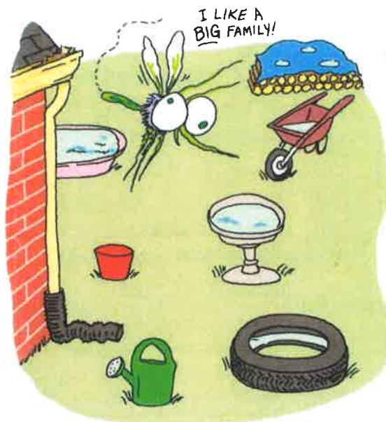
Empty watering cans, children's buckets, etc.