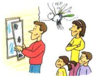
Make sure door and window screens fit tightly and all holes repaired.