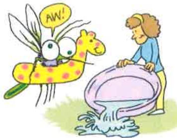
Drain unused swimming pools. Empty wading pools at least weekly.