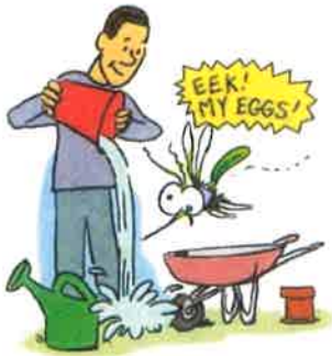
Empty buckets, drums, or water-holding containers.