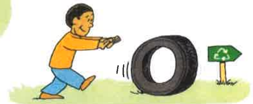
Get rid of old tires.